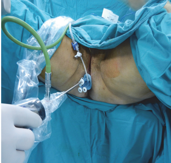
Figure 1. The application of the three-input single-port into the perianal area with sutures.

the operation. The patient was discharged on the first postoperative day. The patient's pathology reported the case to be one of high-grade dysplasia with clean surgical margins. The check-up in the 3rd postoperative month showed the colonoscopy to be normal and the patient did not have any fecal incontinence. After the rectal port usage, we did not observe any complications in this case despite the risk of anal sphincter dysfunction.