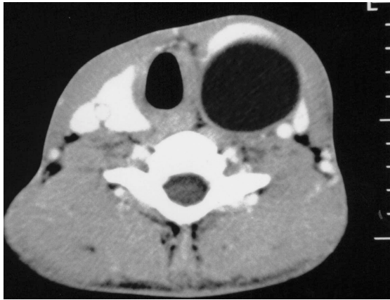
Figure 1b- After a medical treatment, thyroidal cyst showed diffuse membrane detachment indicating hydatid disease and regression in a size.