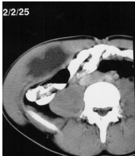
Figure 1c- CT of the abdomen shows right abdominal wall hydatid cyst with diffuse detached membrane.

patient was treated with 400 mg. mebendazole per day. 2-months later, CT examinations were performed again. At this time, significant regression was determined in cysts sizes. Contrast-enhanced CT scans demonstrated typical membrane detachment at the inner layer of thyrooid cysts (Fig. 1b), abdominal wall cyst (Fig. 1c) and liver cysts. Although renal cyst appearance was unilocular, there was a small area at the lateral margin of the cyst with detached membrane (Fig 1d). On chest CT, right lung hydatid cyst was seen as small constricted lesion containing air density because of bronchial rupture with thick and irregular wall structure. Cyst rupture occurred spontaneously and did not cause any clinical problem such as anaphylactic reaction.