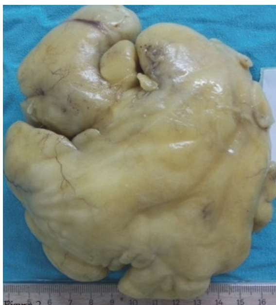
Figure 2. Macroscopically the tumor was lobulated, well circumscribed, surrounded by a fibrous capsule and measured 13x11x4,5 cm.