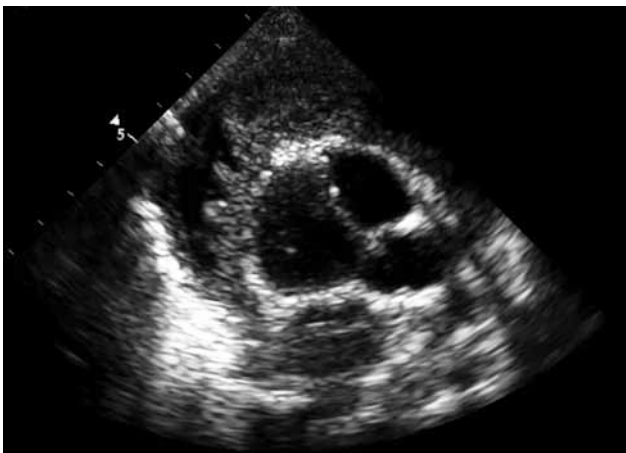
Figure 1. Echocardiography showing the fibrinous pericardial effusion.

Complications associated with the VP shunt include shunt obstruction, infection, seizure, and shunt disconnection. [1,2] A review of the literature revealed numerous sites for distal catheter migration, for example the chest, heart, umbilicus, colon, stomach, bladder, scrotum, and anus, with these migrations usually involving the perforation or penetration of abdominal and thoracic organs. [3,4] Several cases of VP shunt catheter migration into the heart or pulmonary artery have been reported [2,4] in which the distal catheter of the VP shunt migrated into the two sites via the internal jugular vein. Therefore, careful, proper placement of the distal catheter during the tunneling procedure should be emphasized to prevent life-threatening complications. Several cases have also been reported of the VP shunt catheter migrating into the lungs via diaphragm. [3] Moreover, we found two cases in the literature of cardiac tamponade after VA shunt placement. Mastroianni et al. [5] presented a