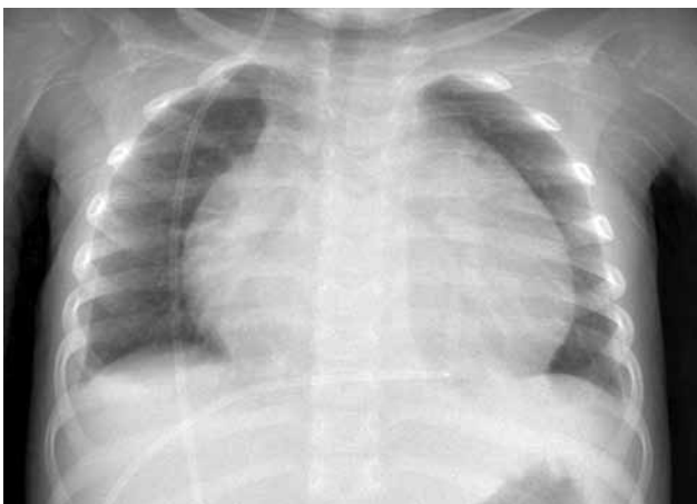
Figure 2. Chest X-ray showing the cardiomegaly and ventriculoperitoneal shunt catheter tip in the pericardium.