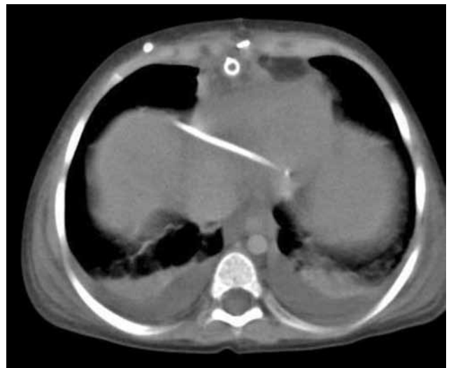
Figure 3. Computed tomography showing the shunt catheter tip in the pericardial cavity along with pericardial effusion.