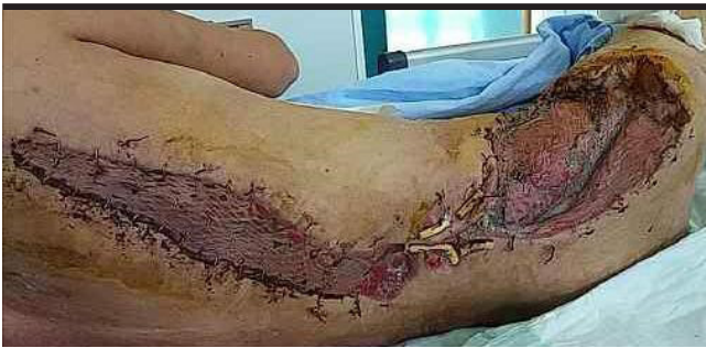
Figure 2. Appearance of the wound after grafting

case wherein biliary leakage following gunshot injury to the liver was controlled by the VAC system. Because they are well known, open surgery, percutaneous drainage, and endoscopic procedures have been described for the management of biliary leakage following gunshot injury to the liver (2). The current patient was scheduled to have an ERCP, but an unexpected circumstance (necrotizing fasciitis) forced her to undergo surgery followed by application of the VAC system. Fortunately, the success of the VAC system turned the disadvantage of necrotizing fasciitis into the advantage by managing both biliary leakage and infected wound non-operatively.