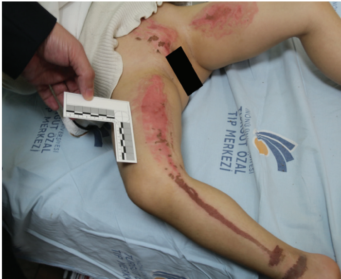
Figure 1. Body areas on which hot water had been poured as punishment.

From the history taken from the child, it was learned that the injuries had been caused by the stepfather because of urine incontinence. In the physical examination, there was seen to be a scabbed lesion behind the ear, a hyperemic-based lesion 7 x 5cm in size in the upper pubic region extending to both labia majus, which had healed with scabbing in places, a lesion 9 x 6 cm in size on the upper and mid inner surfaces of the left thigh which was hyperemic based, scabbed and partly peeling, and scabbed lesions with partially healed areas on a hyperemic base starting from the right-side inguinal region and terminating in the upper part of the medial malleolus of the right ankle (Figure 1).