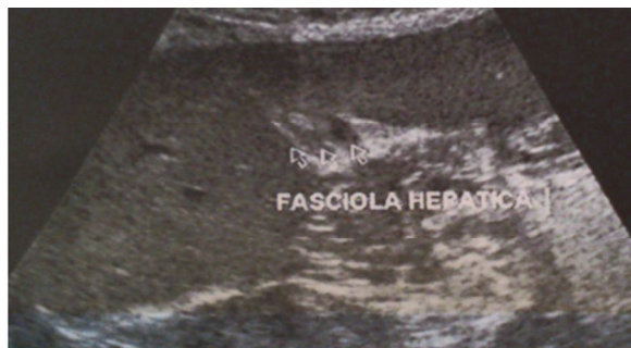
Figure 2. (live parasites) hypoechogenity of internal in Gallbladder lumen

Case 2: USG was performed because of clinical signs in the 34-year-old female patient admitted to the hospital with complaints lasting one month of on going abdominal pain, nausea and vomiting. Antibiotic therapy was started with suspected liver abscess in abdomen USG. Clinical and radiographic improvement was not observed in the patient inspite of antibiotic treatment. Liver biopsy of the patient was performed for the diagnosis of malignancy. Pathological examination was reported as consistent with abscess formation. Eosinophilia, anemia, and slight increase in CRP levels and sedimentation were found. ALP and GGT levels were found at high levels in the laboratory tests. Titer in Hydatid IHA test was positive (titer, 1:320) and F. hepatica IHA test was also detected as positive (titer, 1:1280).