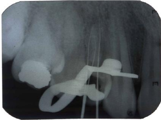
Figure 1. Determination the working length

The root canals were dried with sterile paper points and obturated by laterally condensed gutta-percha (Roeko, Germany) and AH Plus (Dentsply Maillefer,