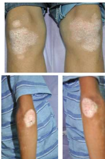
Figure 2. Hyperkeratotic lesions over the skin of the case. Lesions on the elbows and knees.

The intra-oral examination revealed that he lost his deciduous teeth by 4 years of age. In the radiological and