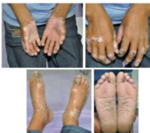
Figure 1. Hyperkeratotic lesions over the skin of the case. Lesions on the hands and feet.

A 9-year-old boy presented to the Department of Periodontology, Faculty of Dentistry, İnönü University. His extra-oral examination revealed hyperkeratotic lesions on his palm, soles, the back of his foot/hand, which extended up to his fingers, and the knee and elbow regions (Figure 1, 2). We learned that the thickening had started on his hand and soles after he turned 1 year of age and had continued to increase gradually after he turned 3 years of age. In the patient's was detected any other problem mentally and systemically. No PLS findings had been reported in other family members, and the patient's parents are not related. He had been diagnosed with psoriasis after a previous dermatological examination.