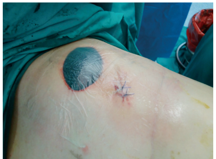
Figure 3. Placement of polyurethane sponge in VAC treatment, closing with drape for no air