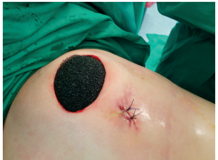
Figure 2. Placement of polyurethane sponge in VAC treatment, the end of the placement of the cavities