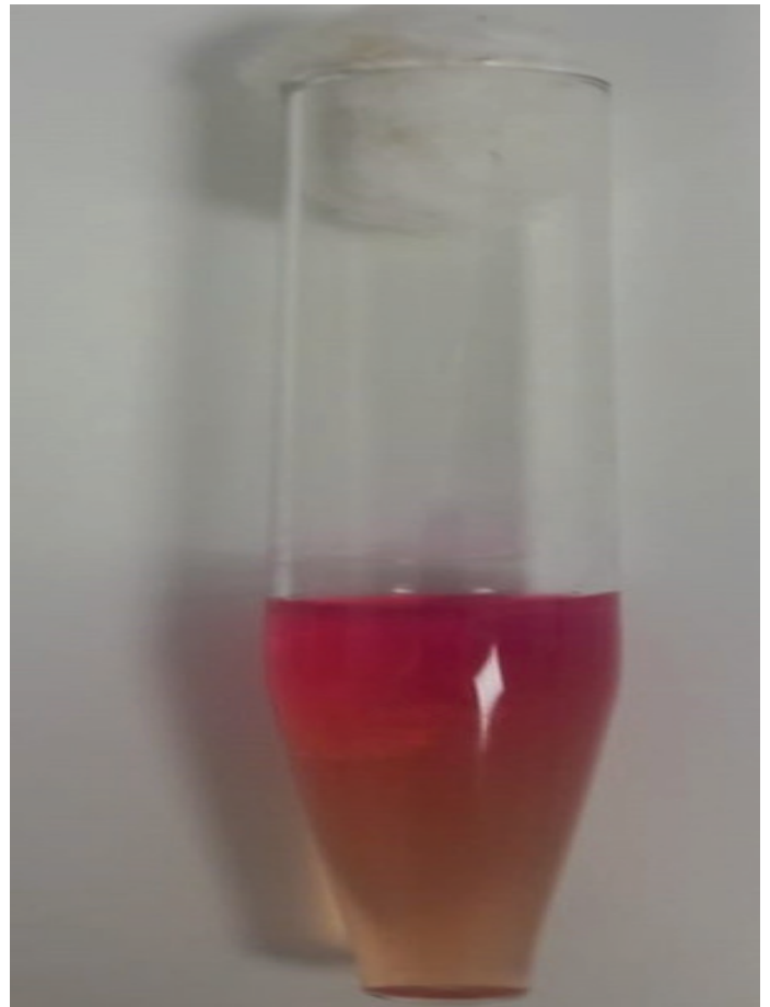
Figure 2. Yellow color turned to pink color of Christensen's urea agar

France) and it was detected as Cryptococcus neoformans by the rate of 95%. Antifungal susceptibility was performed by E-test method. The minimum inhibitory concentration (MIC) values for amphotericin b, voriconazole, fluconazole amphotericin B were detected as 0.064 µg/ml, 3 µg/ml, 2 µg/ml, respectively.