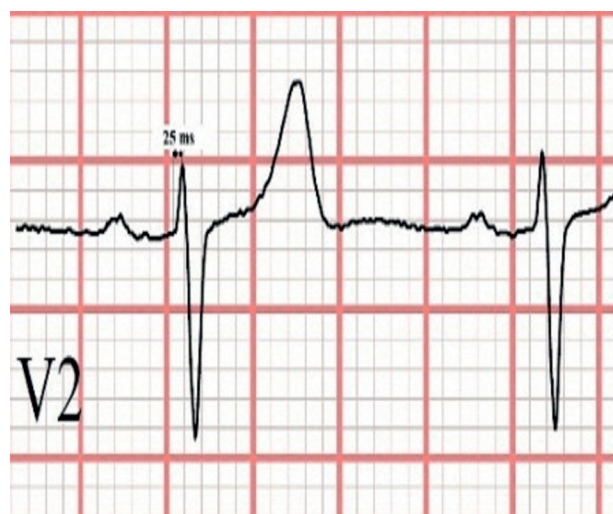
Figure 2 B. Please note that IDT in lead V2 is significantly prolonged in the patient with Type 2 Brugada pattern than that in the control subject (45 msec vs 25 msec, respectively)