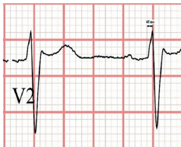
Figure 2 A. 12-lead ECG recordings of a patient with conversion of Type 2 Brugada pattern to Type 1 Brugada pattern in lead V2 with ajmaline testing (A), and a control subject without Type 2 or Type 1 Brugada pattern in lead V2