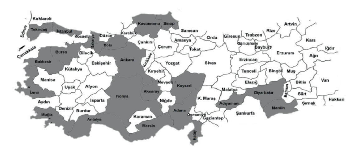
Figure 1. Turkey map showing the locations of selected cities (in bold) in which tap water samples were collected

and city except for Istanbul. The cities are as follows: Aksaray, Konya, Adana, Mersin, Ankara, İzmir, Balıkesir, Kastamonu, Sakarya, Antalya, Bolu, Sinop, Hatay, Bursa, Muğla, Kayseri, Diyarbakır, Adıyaman, Mardin ve Tekirdağ and İstanbul (21 cities in total) (Figure 1) and because İstanbul is a very big Metropol we tried to get different tap waters from 16 districts which are Bakırköy, Zeytinburnu, Beylikdüzü, Sarıyer, Fatih, Kartal, Kadıköy, Ataşehir, Küçükçekmece, Ataköy, Gaziosmanpaşa, Beşiktaş, Şişli, Başakşehir, Bayrampaşa, and Bahçelievler to represent different locations of İstanbul. We did not apply to an ethics committee because we did not examine a living material in our study.