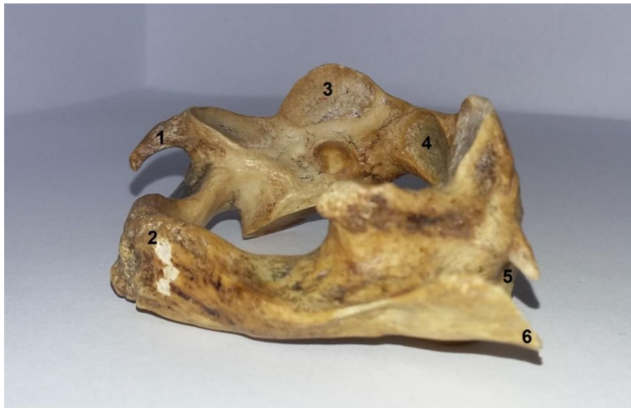
Figure 2. Unilateral and partial Kimmerle's Anomaly. (1: Ponticulus posticus, 2: Arcus posterior atlantis, 3: Proc. art. superior; 4: Fovea dentis; 5: For. transversarium; 6: Proc. Transversus)