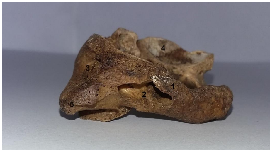
Figure 3. Unilateral and tunnel-shaped Kimmerle's Anomaly. (1: Ponticulus posticus, 2: Lateral view of the tunnel-shape, 3: For. transversarium, 4: Proc. art. superior, 5: Proc. transversus)