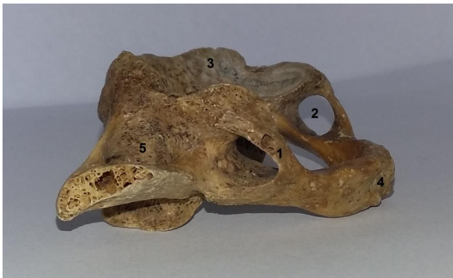
Figure 1. Bilateral and total Kimmerle's Anomaly. (1: Bony bridge PP joins arcus posterior atlantis and lateral mass of the atlas, 2: Canalis arteriae vertebralis, 3: Proc. art. superior, 4: Tuberculum posterius, 5: For. transversarium)

Kimmerle's Anomaly was found in 3 different atlases during the routine anatomy practice within the scope of medical education. In one of these atlases, bilateral and total (Figure 1) anomaly was discovered while in another, the anomaly was unilateral (left) and partial (Figure 2). As for the third one, it was unilateral (left) and tunnel-shaped (Figure 3 and 4).