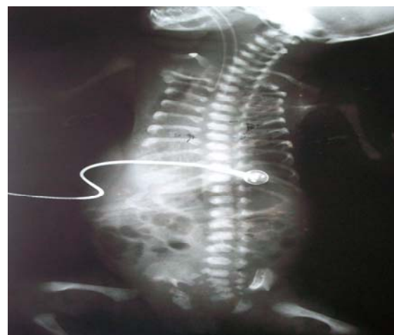
Figure3. Antero-posterior pelvic x-ray revealed hypoplastic iliac wings, narrowed sacrosiatic notches, dysplastic (trident) acetabular roofs and shallow acetabular angles.

Antero-posterior pelvic x-ray revealed hypoplastic iliac wings, narrowed sacrosiatic notches, dysplastic (trident) acetabular roofs and shallow acetabular angles (Figure 3).