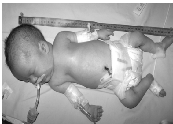
Figure 1. Narrow, long, bell shaped thorax cavity, intercostal and subcostal retractions, rhizomelic shortness of the upper and lower extremities, abdominal distention, macrocephalic head size were noted.

Narrow, long, bell shaped thoracic cavity, intercostal and subcostal retractions, rhizomelic shortness of the upper and lower extremities, abdominal distention, macrocephalic head size were noted (Figure 1).