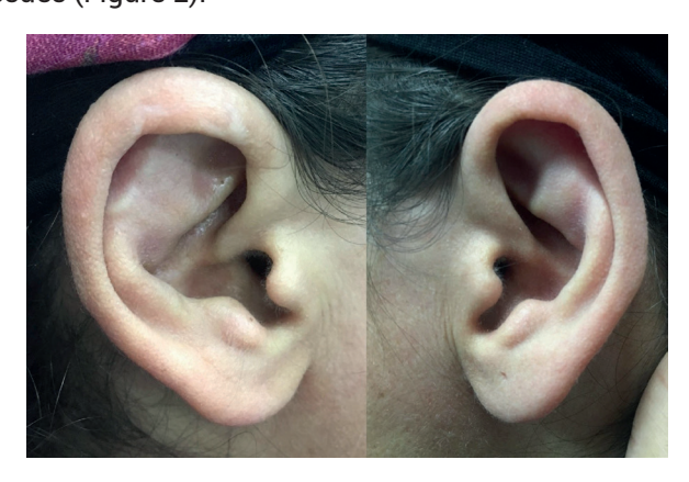
Figure 1. The patient's auricles with normal appearance

a natural appearance (Figure 1). Apart from lobules, the bilateral auricle had lost its elasticity. Computed tomography of the temporal bones showed bilateral calcification of auricles and external auditory canals with normal soft-tissue density of the overlying subcutaneous tissues (Figure 2).