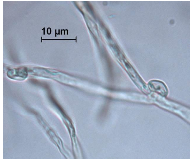
Figure 3. hyphae of Phleogena faginea